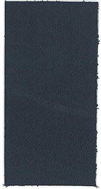
Phoenix • Navy