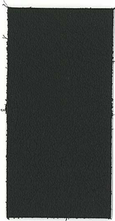
Phoenix • Spade

A light coat with pigment is added for overall color consistency.