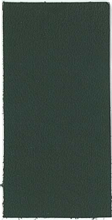
Phoenix • Bottle Green