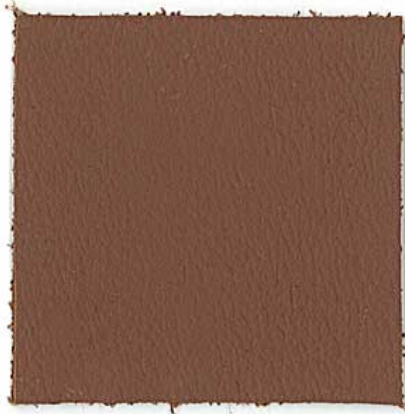
Phoenix • Terra