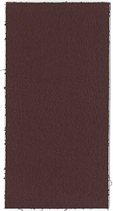
Phoenix • Currant