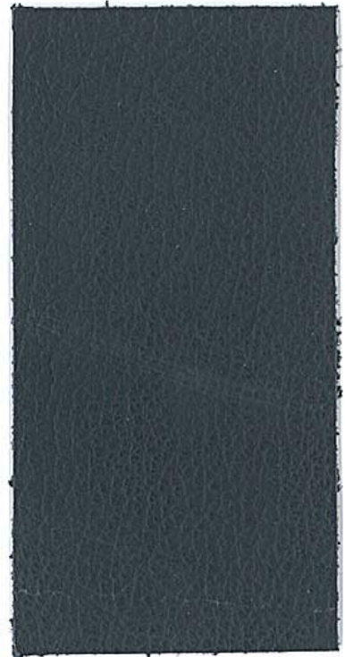
Vienna • Cadet