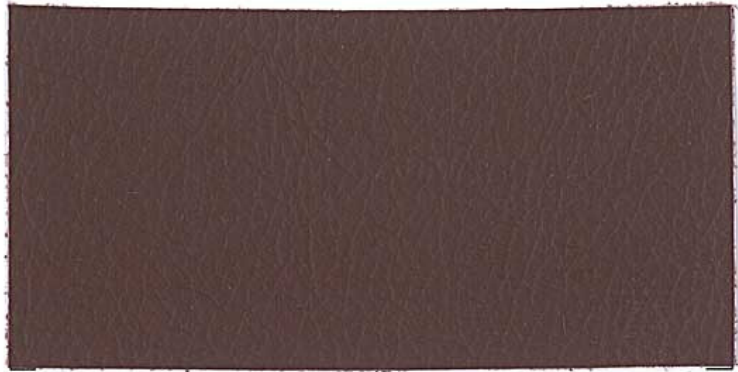
Vienna • Ruby