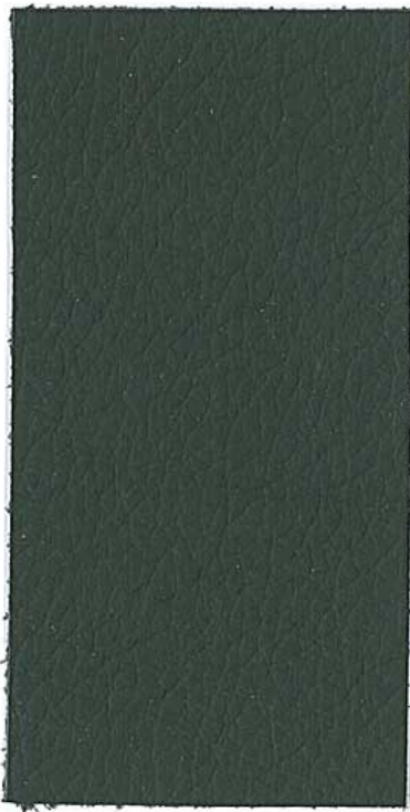
Vienna • Leaf