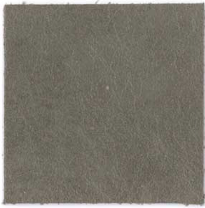
Zodiac • Agate

Zodiac is a top grain, semi-aniline leather with a soft, silky hand and a subtle two-tone effect creating both depth and character.