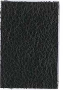
Zodiac Black Opal