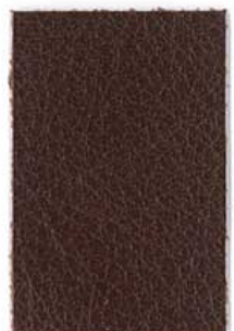
Zodiac Tiger Eye